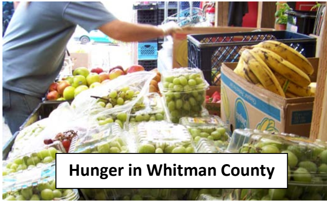
Hunger in Whitman County